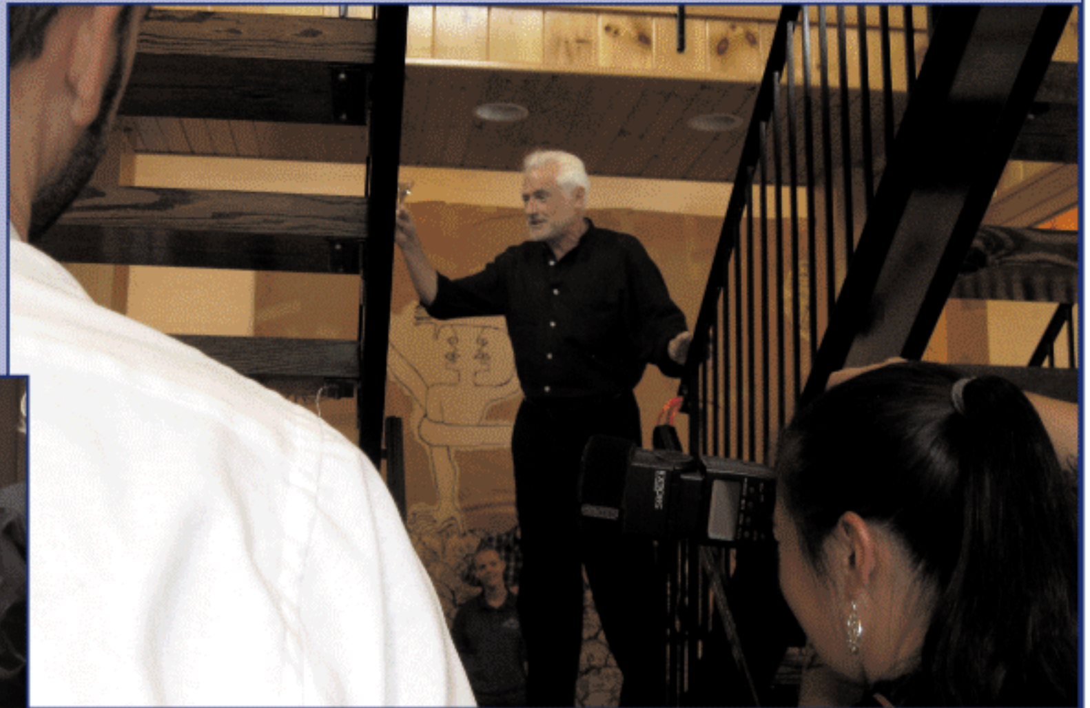
Not only will it house the permanent collection of contemporary artist Alexander Kaletski it will also display the works of local artists and visiting artists from around the world. (Contd. Pg. 9)

With two floors and a open central area to display art, the Claryville Art Center is prime to be one of the most beautiful art centers in the Catskills and upstate New York.