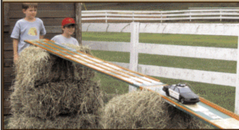
Old-fashioned fun for everyone! Two young lads are enjoying the natural kinetic energy that is driving the car down the ramp.

The clouds gave way to the sun on Saturday adding a bright touch to this year's Time and the Valleys Museum Old Time Fair held at the fairgrounds in Grahamsville. Visitors to enjoy an old-fashioned lazy, hazy, crazy day of summer.